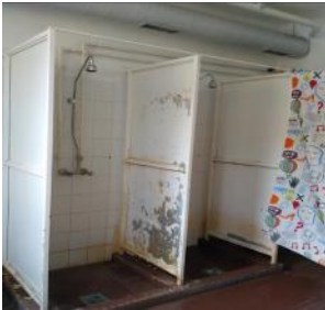
Old Shower facilities

This year's Lent Appeal Project is for the Menedékház in Hungary. Founded in 2005 on the outskirts of Budapest it helps homeless families with children reintegrate into the workplace and society at large. We aim to fund the comprehensive renovation of the family washrooms, providing individual cabins or cubicles for family groups to change, wash, and shower.